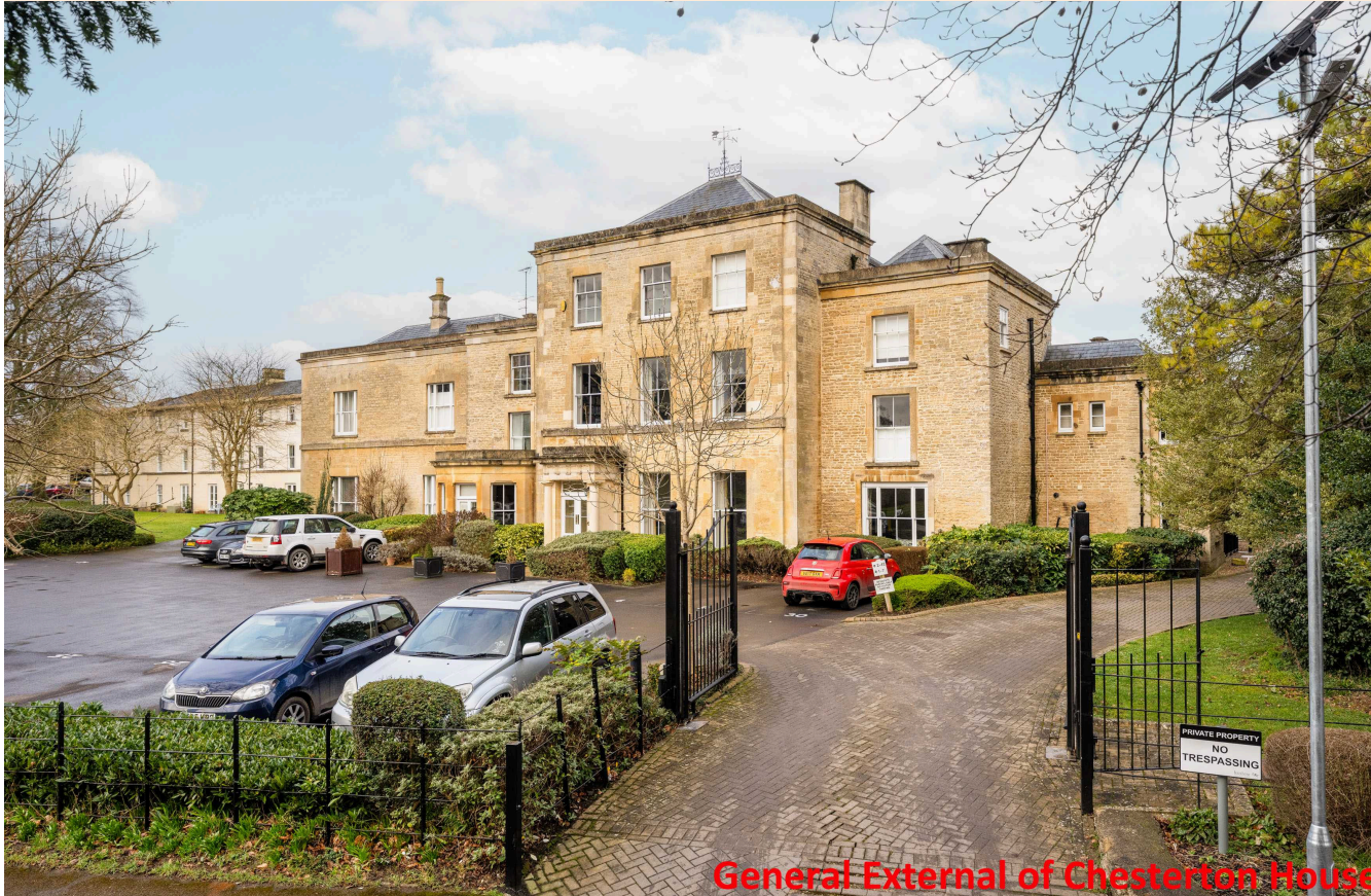
General External of Chesterton House