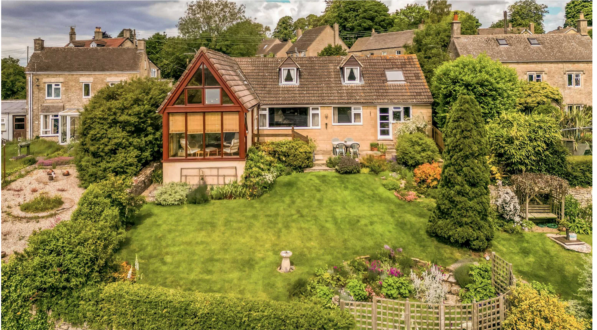
Little Oaks , France Lynch, Stroud, Gloucestershire, GL6 8LJ